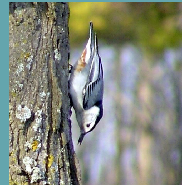
White Breasted Nuthatch

Spring and Sydney's Ponds provide valuable wildlife habitat for resident and migrant birds.